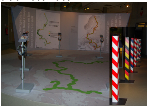
Parts of the European Green Belt exhibition, Linz, Austria

Bring this successful exhibition to your town! The exhibition "The European Green Belt: Borders. Wilderness. Future" was shown to great public and media acclaim (approx. 90,000 visitors) for six months at Schlossmuseum Linz. After the end of the exhibition in January 2010, the developers of University of Vienna offer the modular exhibits for display in other parts of Europe. If you are interested in more details, please contact Katharina Zmelik to receive the exhibition folder.