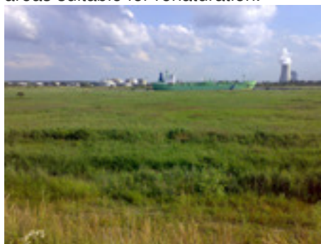
Area bordering the Rostock harbour

end, an area of 4,4 ha in the estuary of Peetzer stream was declared. Even though, this area is not large in total, this is a meaningful achievement, as this area is located right next to other areas suitable for renaturation.